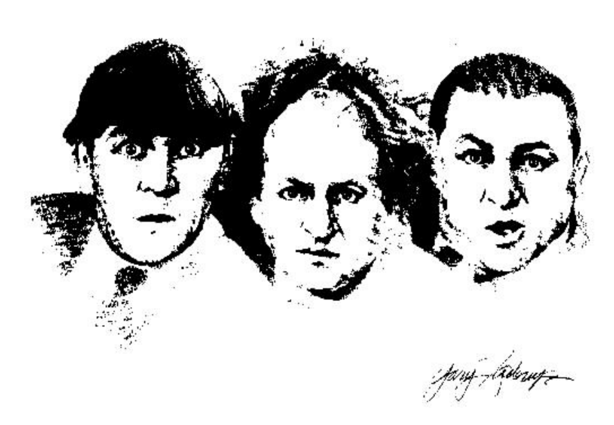
Gary Saderup's 3 Stooges